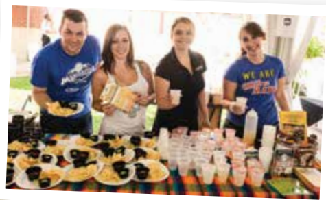
Margaritas Restaurant, Hingham