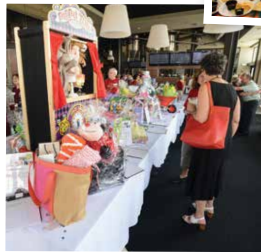
Hingham Beer Works hosted the VIP reception and silent auction