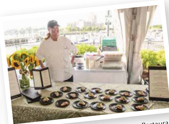
Alma Nove Restaurant