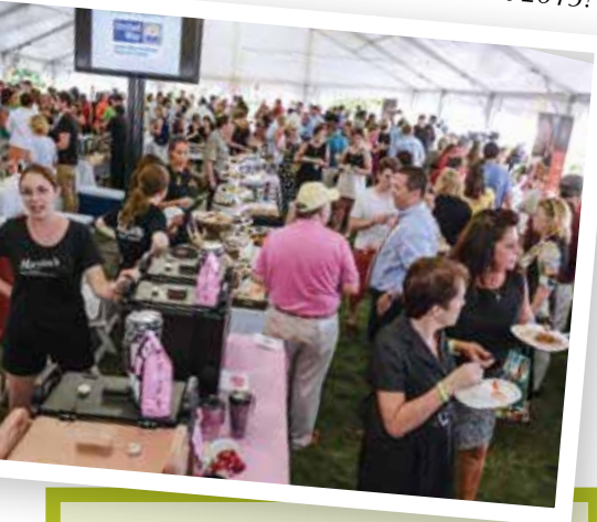
MaryLou's Coffee at FoodFest 2015!