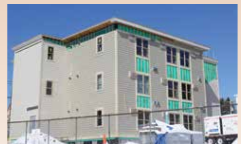
Jack's Place construction - April 2016

Our work would not be possible without champions like The Home Depot Foundation – as their belief and support of our services has been paramount to this project's success. Because of such contributors, we are