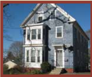
2 units for families