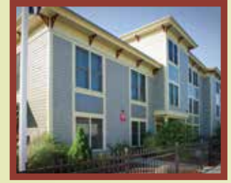
JEFF'S PLACE 32 units for individuals (15 units dedicated to veterans)