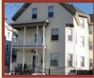
3 units for families