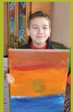
Children from Temple Kol Tikvah created and donated items to Evelyn House family shelter.