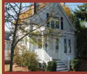
TOM'S HOUSE 3 units for individuals