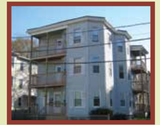
3 units for families