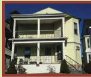
14 units for individuals