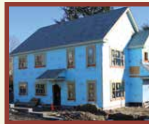
PATTI'S HOUSE Coming Soon! 2 units for families