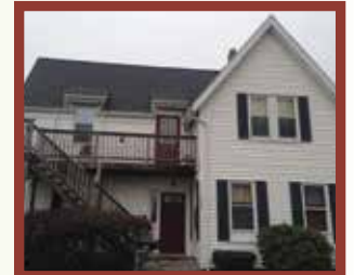
12 units for individuals