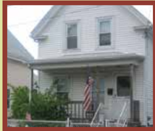
O'NEIL HOUSE 3 units for individuals