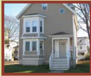
3 units for families