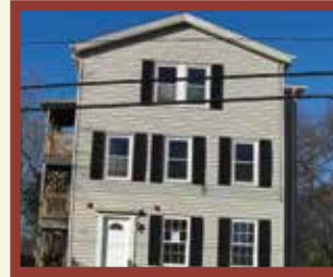
3 units for families