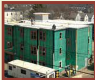
JACK'S PLACE Coming Soon! 20 units for individuals (10 units veterans preference)