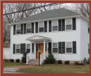
COMMANDER PAUL F. ANDERSON HOUSE 6 units for veterans

In addition to 92* units of housing owned by FBMS, we administer and operate 324 additional units of permanent supportive housing in partnership with local landlords and housing agencies, most notably NeighborWorks Southern Mass. In total, we support 416 individuals and families in permanent housing throughout the region.